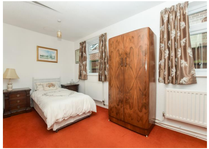
Bedroom 2 13' 1" x 10' 9" (3.98m x 3.27m) Central heating radiator. Window to front.