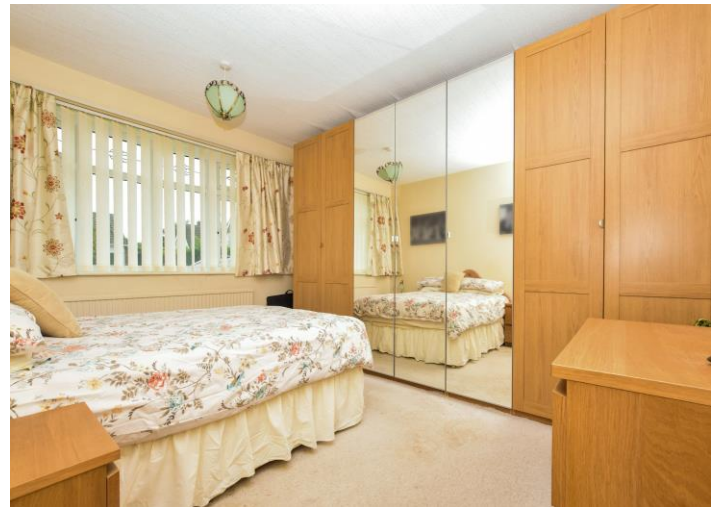
Bedroom 3 11' 8" x 10' 3" (3.55m x 3.12m) Central heating radiator. Window to front.